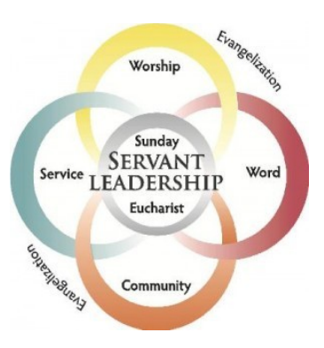
A Parish of the Roman Catholic DIOCESE OF SCRANTON