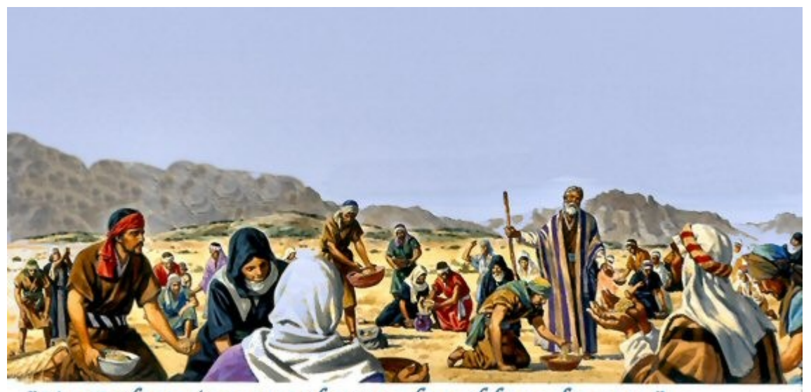
"My Father gives you the true bread from heaven." (In 6:32)