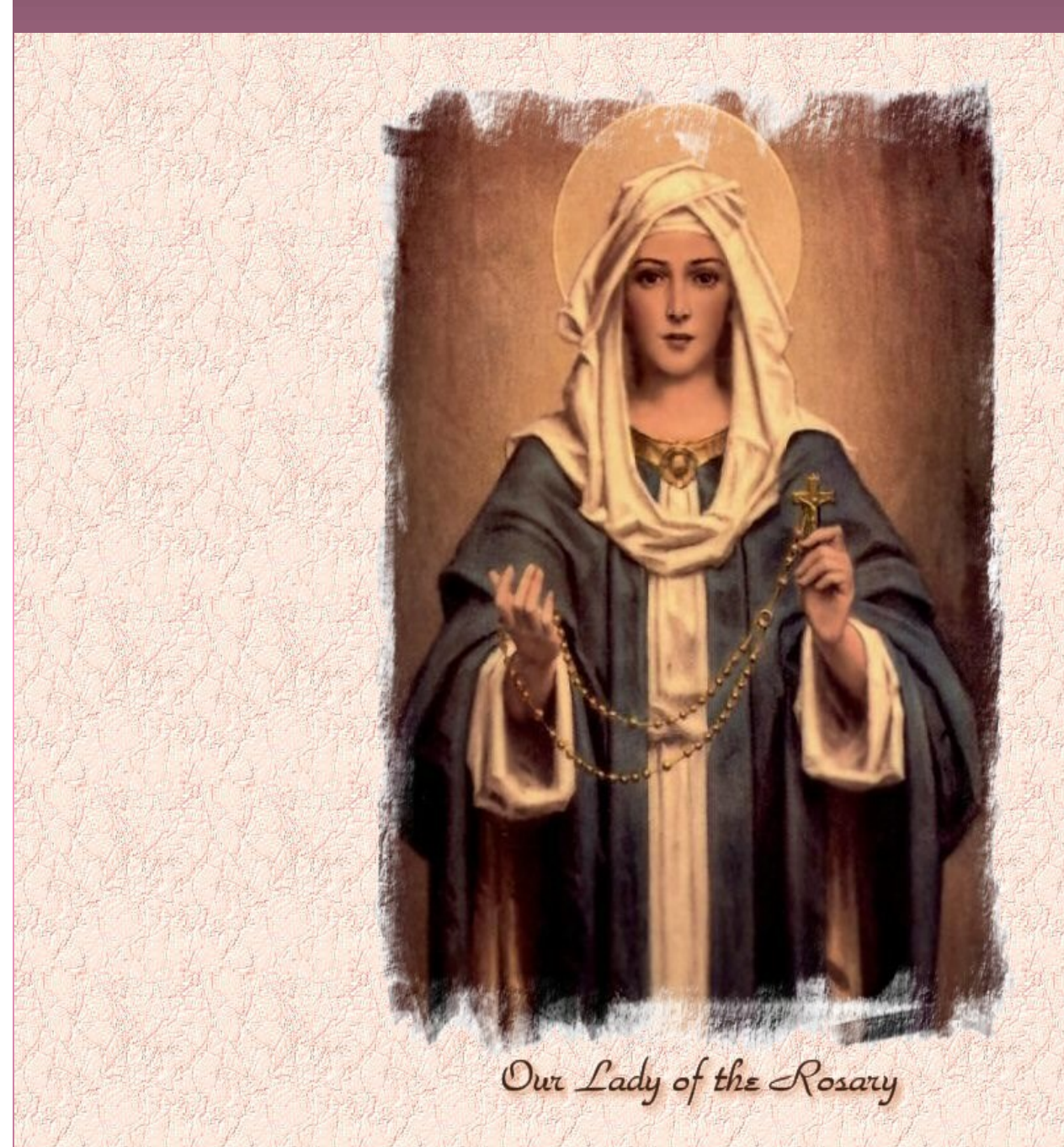
Twenty-Seventh Sunday of Ordinary Time