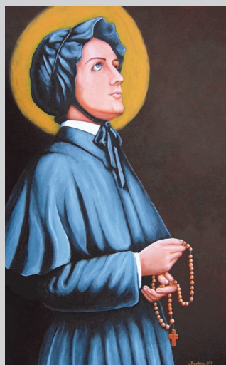
St. Elizabeth Ann Seton, pray for us!

Bulletin deadline: Friday, one week prior to the publication week.