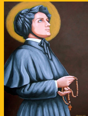
St. Elizabeth Ann Seton Pray for Us!

Bulletin deadline: Friday, one week prior to the publication week.