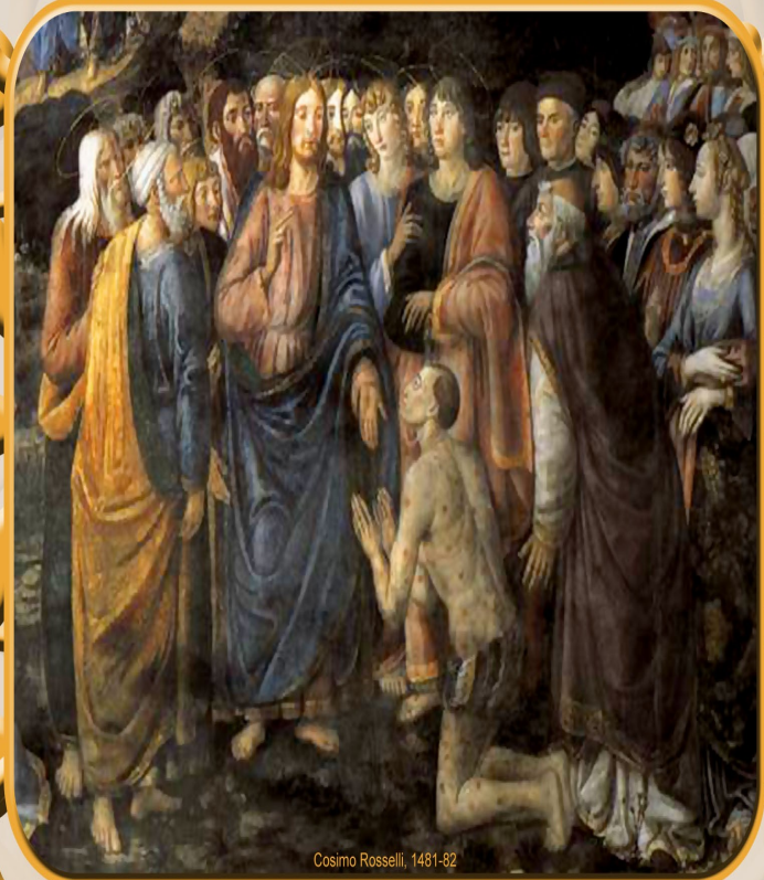
Cosimo Rosselli, 1481-82

©2008 Karides Lic. to St. George Publishing