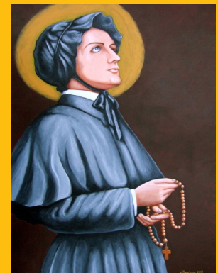
St. Elizabeth Ann Seton Pray for Us!

Bulletin deadline: Friday, one week prior to the publication week.