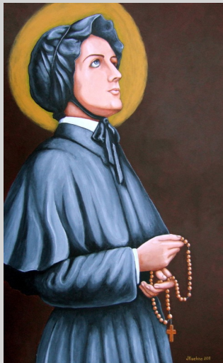
St. Elizabeth Ann Seton, pray for us!

Bulletin deadline: Friday, one week prior to the publication week.