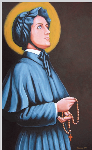
St. Elizabeth Ann Seton, pray for us!

Bulletin deadline: Friday, one week prior to the publication week.