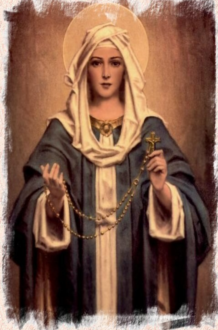
Our Lady of the Rosary