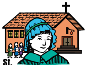
St. Elizabeth Ann Seton