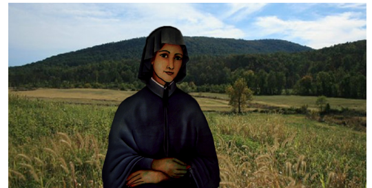
SAINT ELIZABETH ANN SETON,