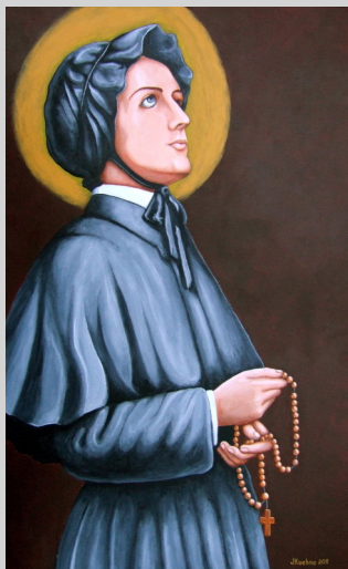
St. Elizabeth Ann Seton, pray for us!

Bulletin deadline: Friday, one week prior to the publication week.