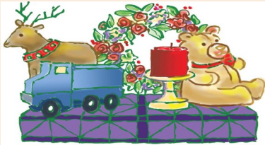
Fall Craft Show at Seton