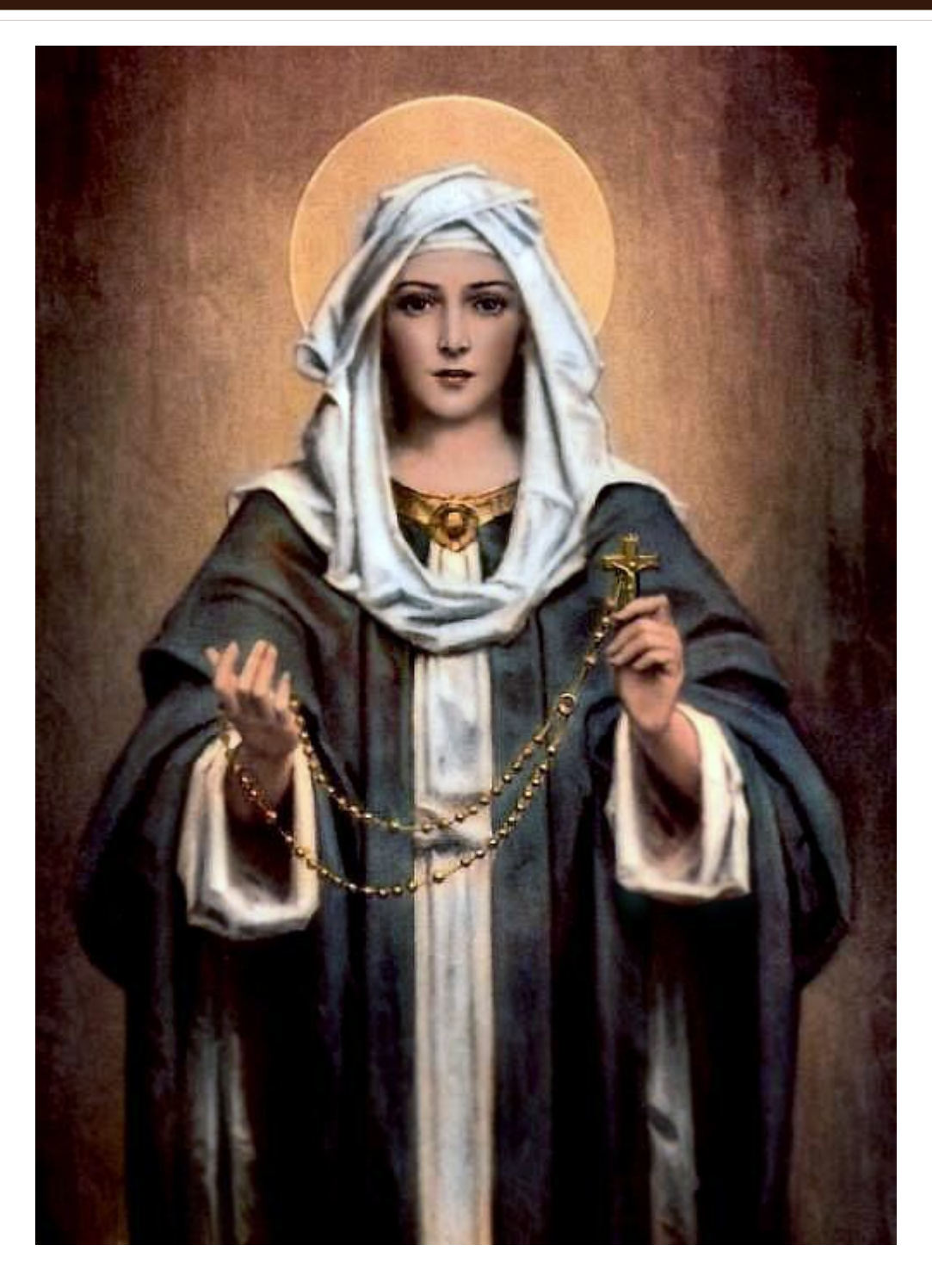
October, Month of the Rosary