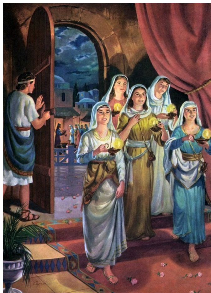
“The Wise and Foolish Virgins”