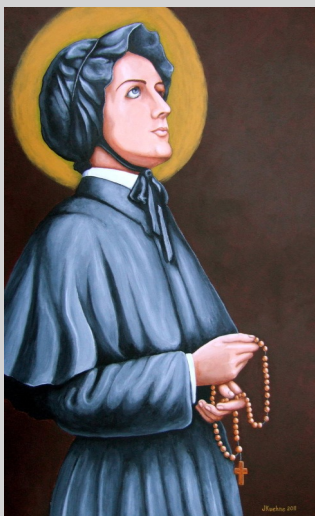
St. Elizabeth Ann Seton, pray for us!

Bulletin deadline: Friday, one week prior to the publication week.