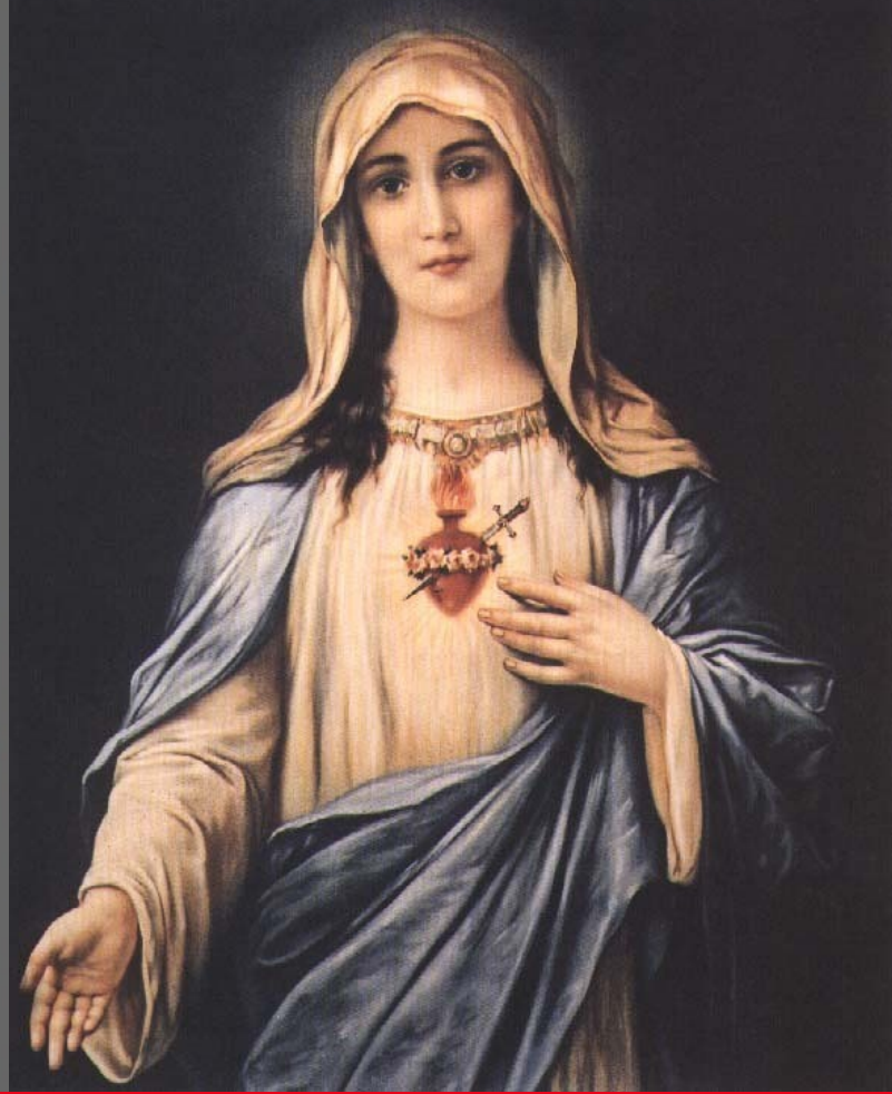
The Immaculate Heart of Mary

June 10, 2018 Tenth Sunday in Ordinary Time