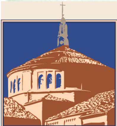
THE NATIONAL SHRINE OF Saint Elizabeth Ann Seton

Visit the Lourdes Grotto/ St. Elizabeth Ann Seton National Shrine in Emmitsburg, Maryland on Wednesday, April 18th.