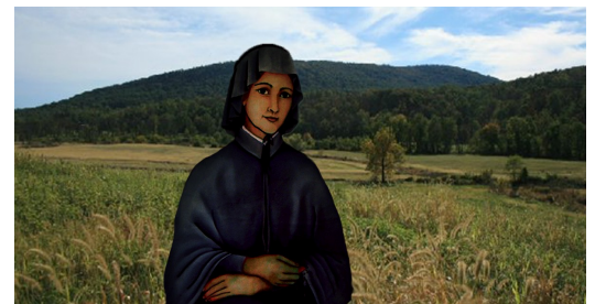
SAINT ELIZABETH ANN SETON,