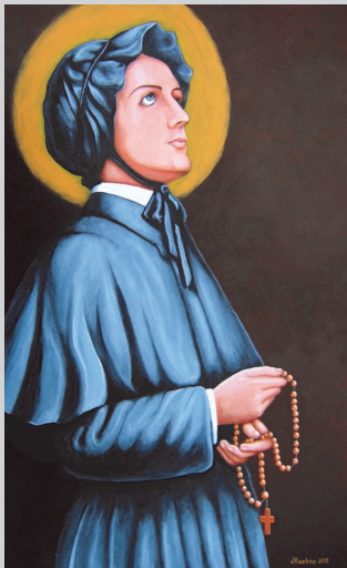
St. Elizabeth Ann Seton, pray for us!