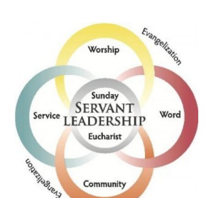
A Parish of the Roman Catholic DIOCESE OF SCRANTON