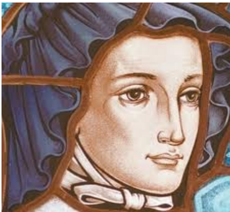
SAINT ELIZABETH ANN SETON, PRAY FOR US!

The next meeting of our Prayer Chain is on Saturday, January 13, 2018, at 9am in our church hall. Please join us!