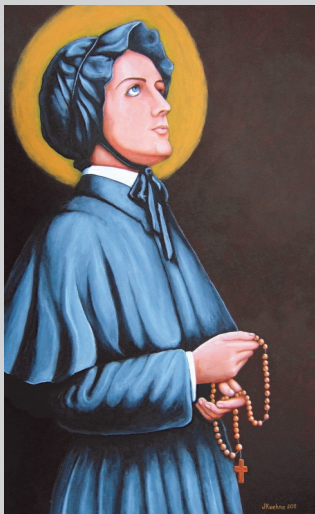
St. Elizabeth Ann Seton, pray for us!

Bulletin deadline: Friday, one week prior to the publication week.