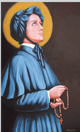
St. Elizabeth Ann Seton, pray for us!

Bulletin deadline: Friday, one week prior to the publication week.