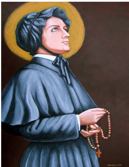
St. Elizabeth Ann Seton, pray for us!

Bulletin deadline: Friday, one week prior to the publication week.