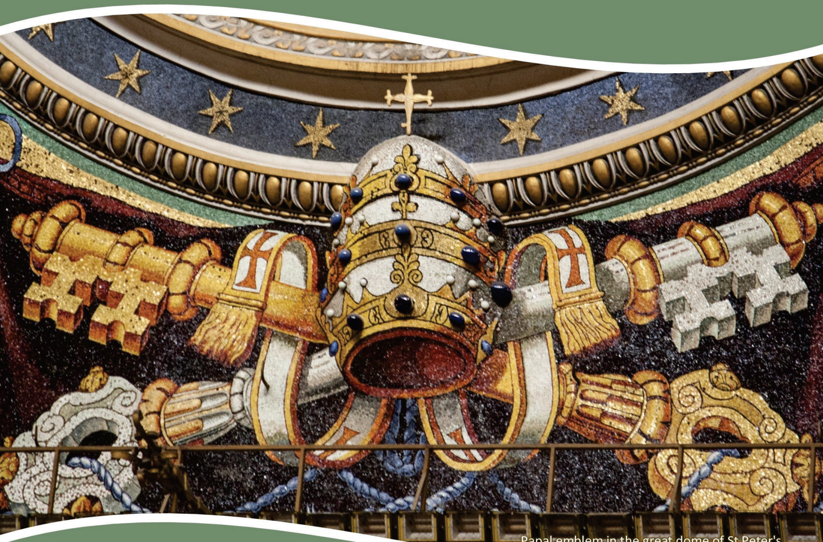
Papal emblem in the great dome of St Peter's Basilica in Rome.