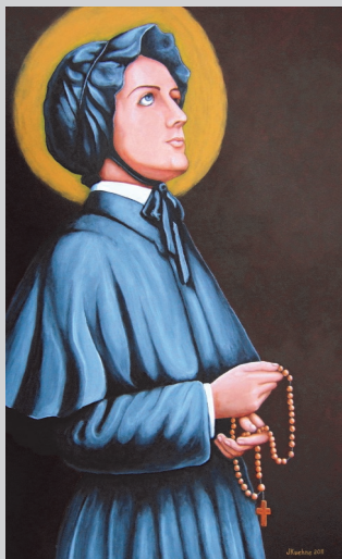
St. Elizabeth Ann Seton, pray for us!