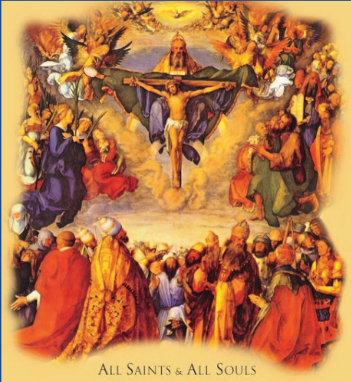
ALL SAINTS & ALL SOULS