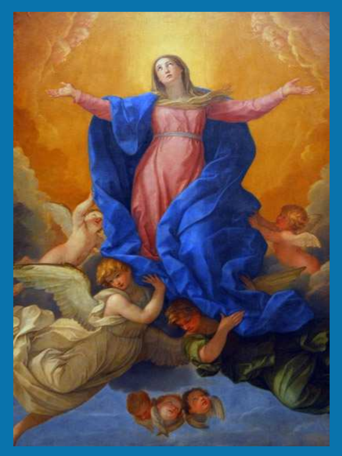
The Seton Sentinel