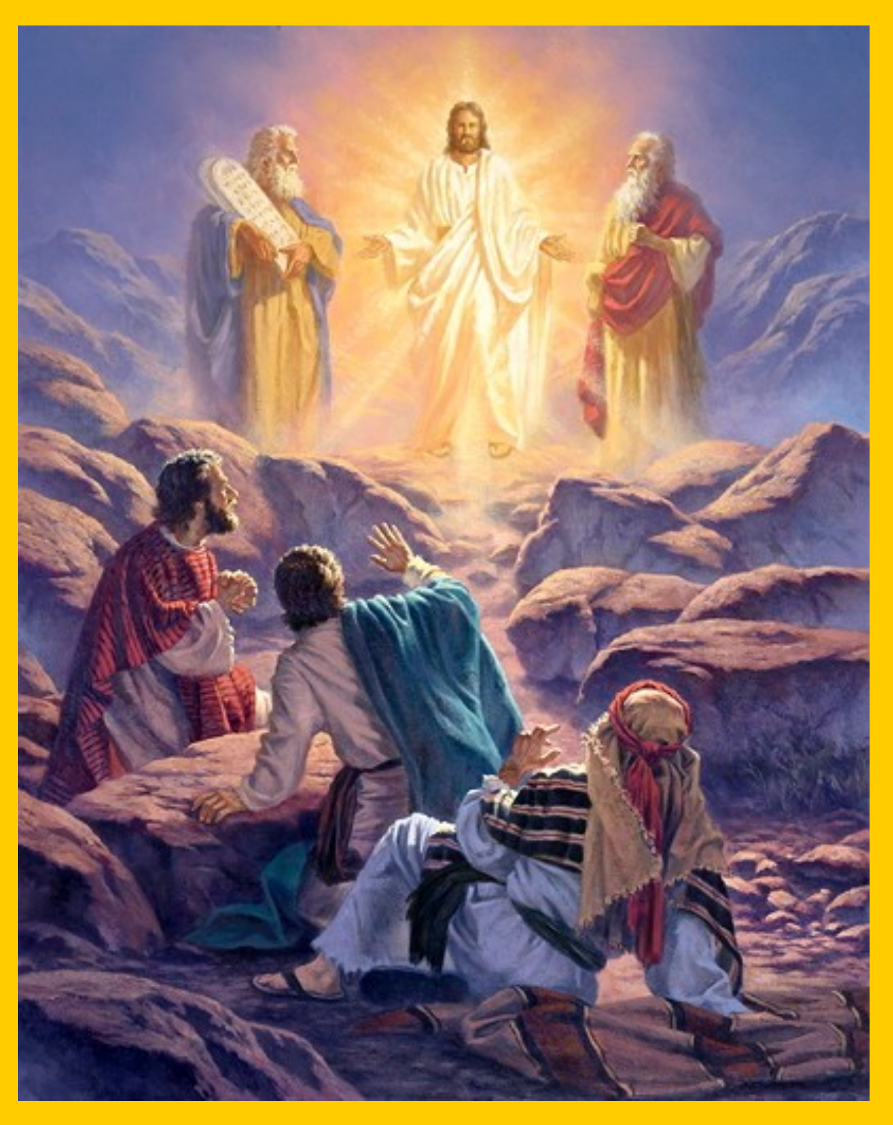
Transfiguration of the Lord August 6, 2017