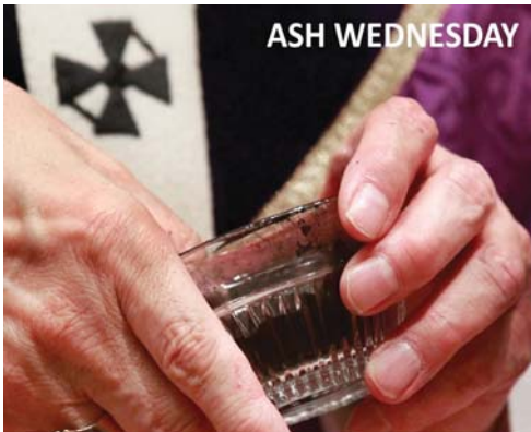
Lent isn't to make public demonstrations of piety—even the wearing of ashes—but to seek conversion of heart.

Our HNS will meet next Sunday, March 6th, after the 9:00am mass in our church hall. New members are always welcome.