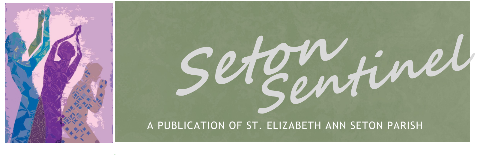
September 29, 2019 TWENTY -SIXTH SUNDAY IN ORDINARY TIME