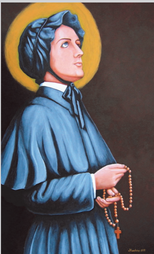
St. Elizabeth Ann Seton, pray for us!