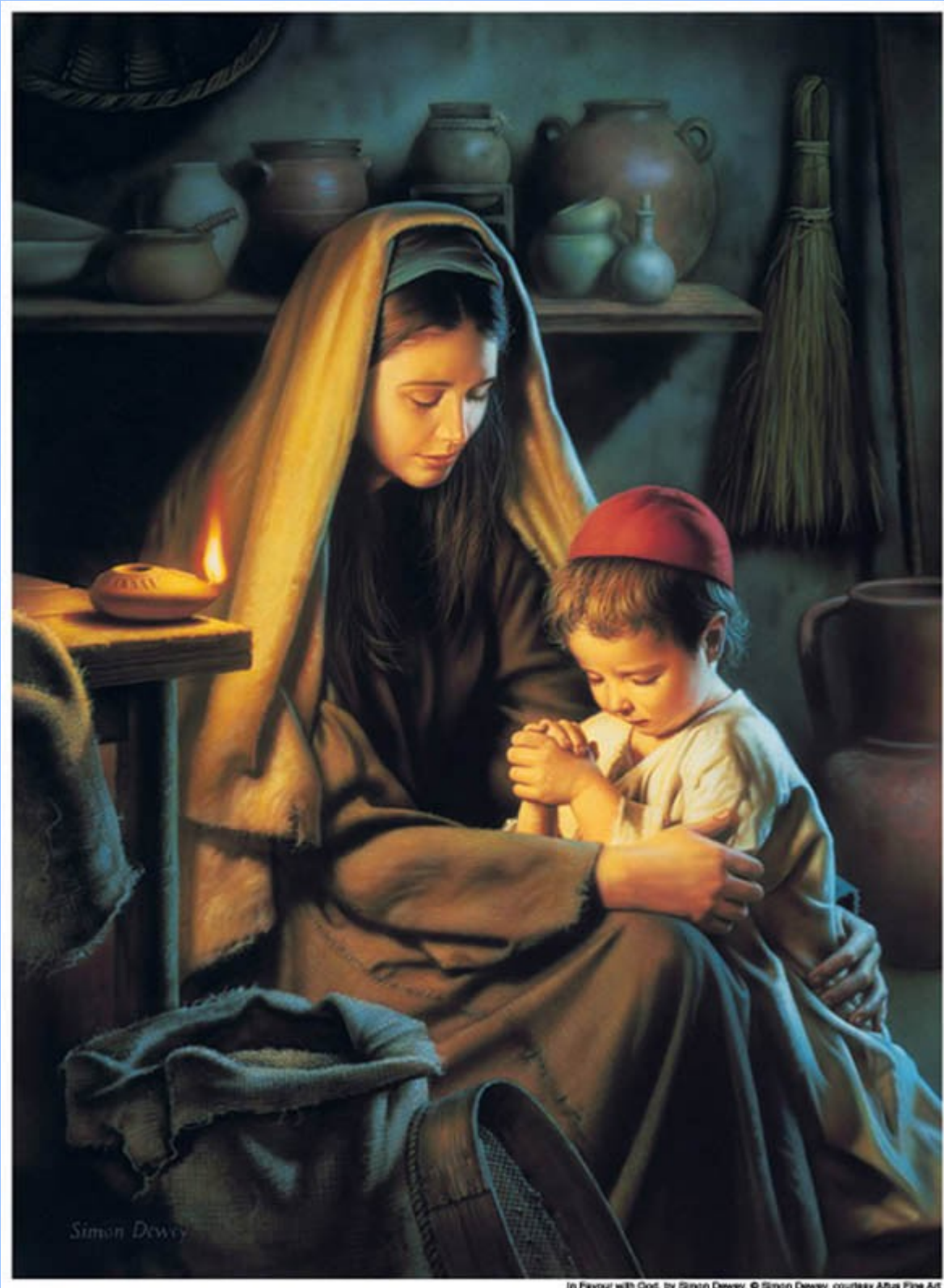
In Favour with God, by Simon Dewey, © Simon Dewey, courtesy Atlas Fine Art