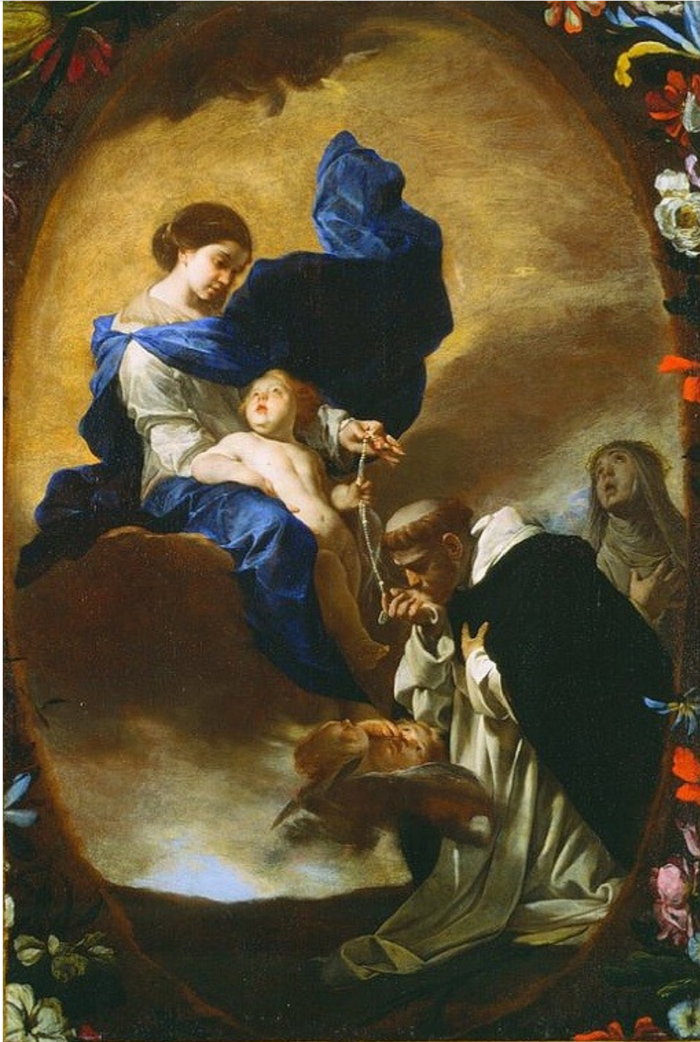
The vision of Saint Dominic by Bernardo Cavallino, 1640