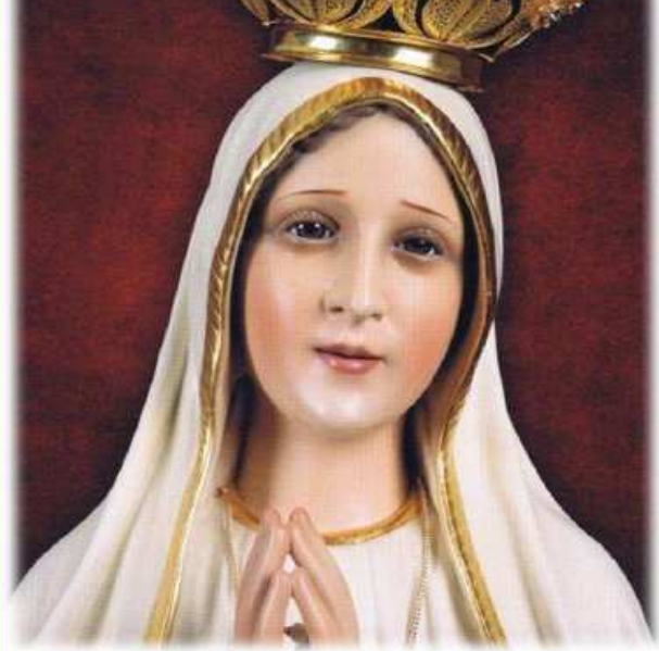
Sponsored by the Knights of Columbus