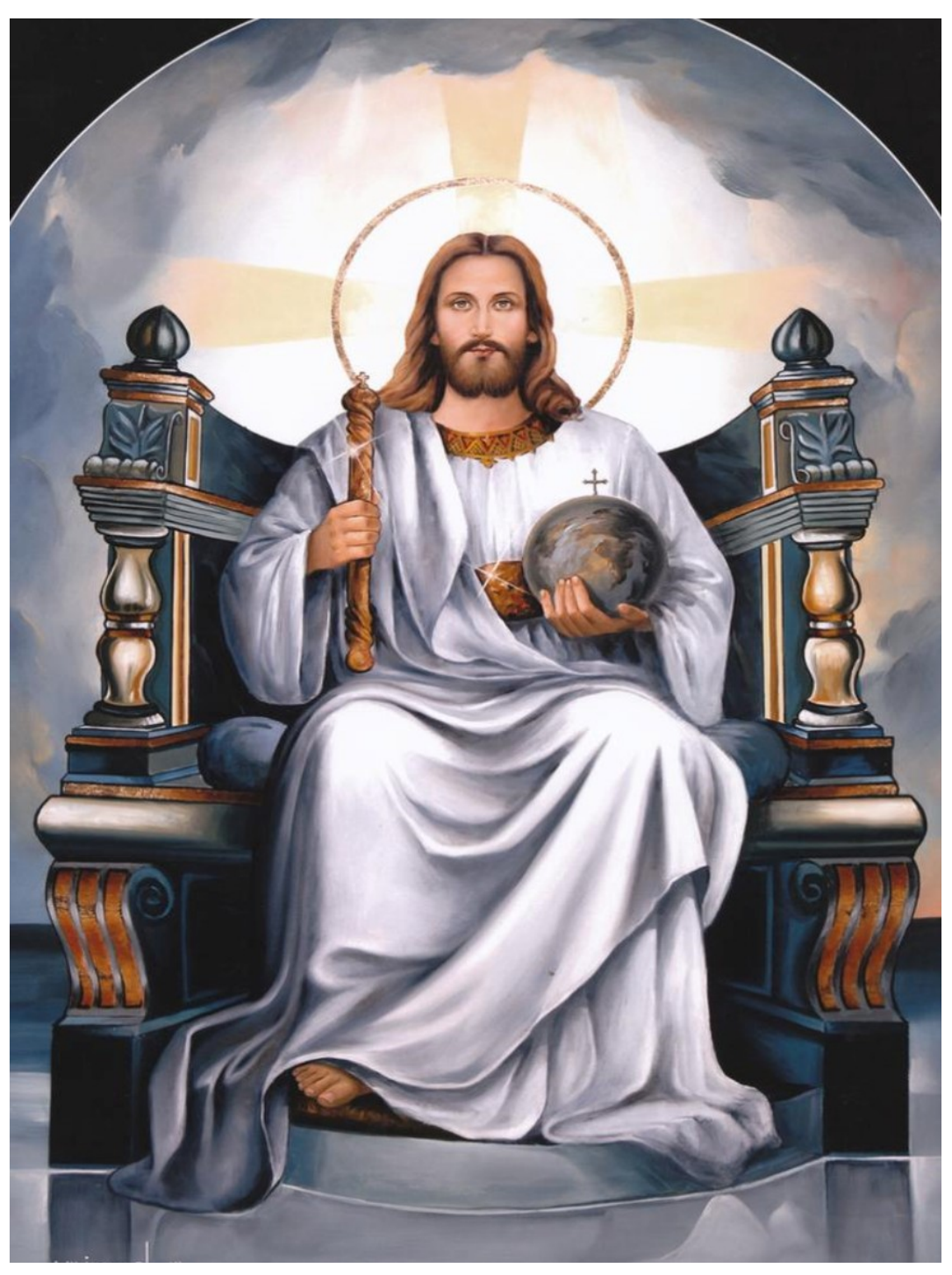
NOVEMBER 24, 2019 SOLEMNITY OF JESUS CHRIST KING OF THE UNIVERSE