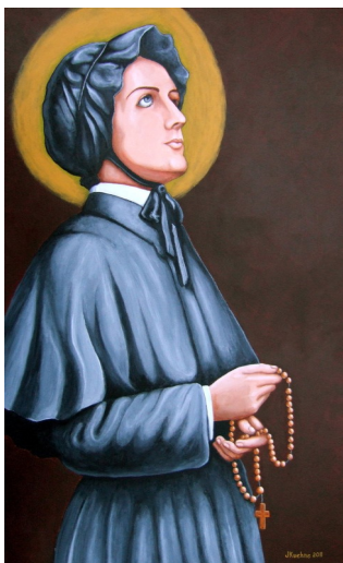
St. Elizabeth Ann Seton, pray for us!

Bulletin deadline: Friday, one week prior to the publication week.