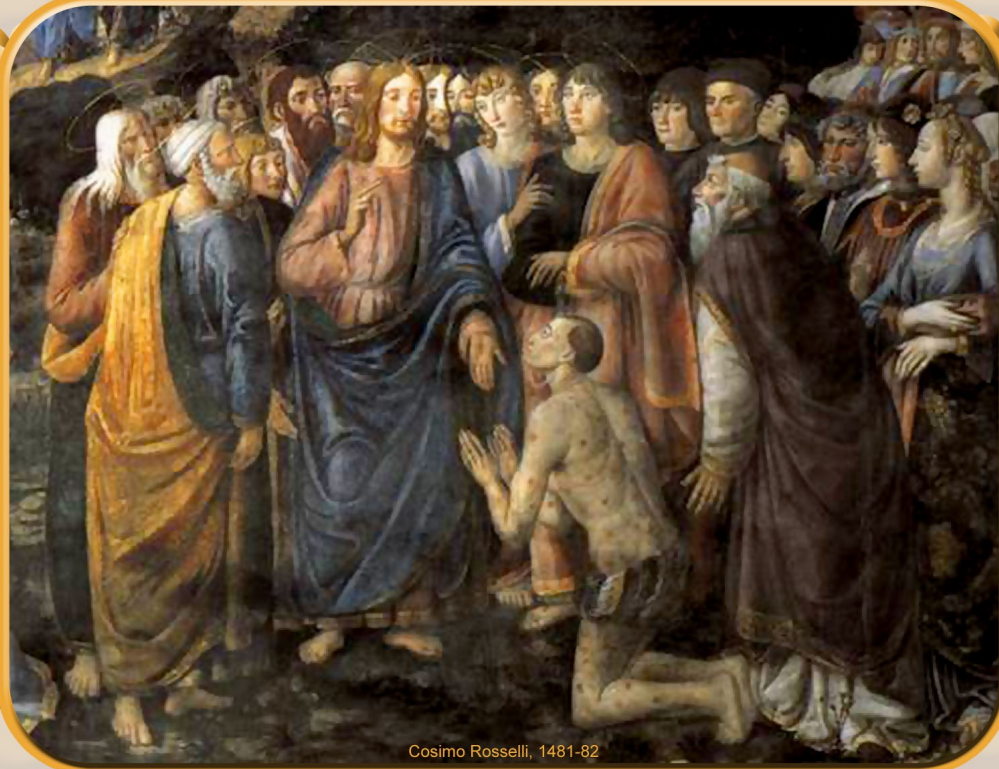
Cosimo Rosselli, 1481-82