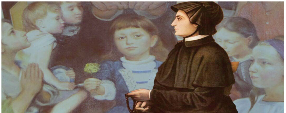
SAINT ELIZABETH ANN SETON, PRAY FOR US!

The presence of children is a gift to the Church and a reminder that our congregation is growing. Please welcome our children and give a smile of encouragement to their parents.