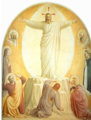
St. Elizabeth Ann Seton Parish