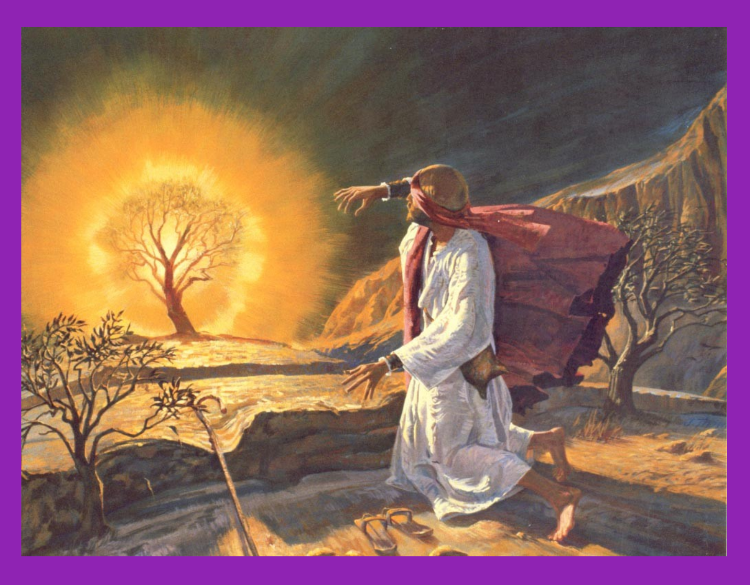
"tell the Israelites: I AM sent me to you." Exodus 3:14