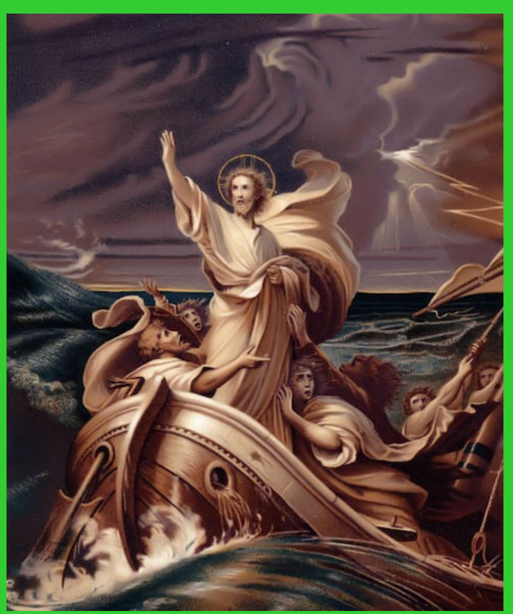
"QUIET! BE STILL!"