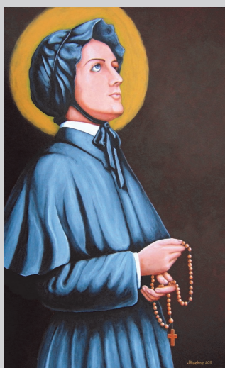
St. Elizabeth Ann Seton, pray for us!