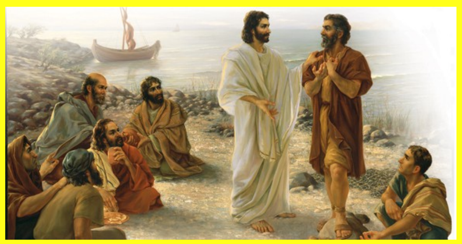
"Peter, feed my sheep!"