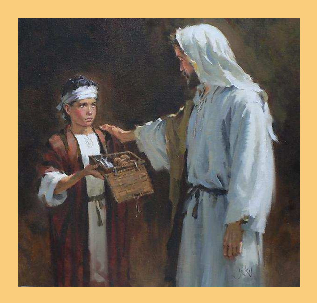
The Seton Sentinel