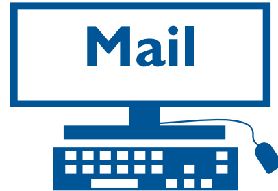
To your inbox

Sign Up at www.pilotbulletins.net/sign-up