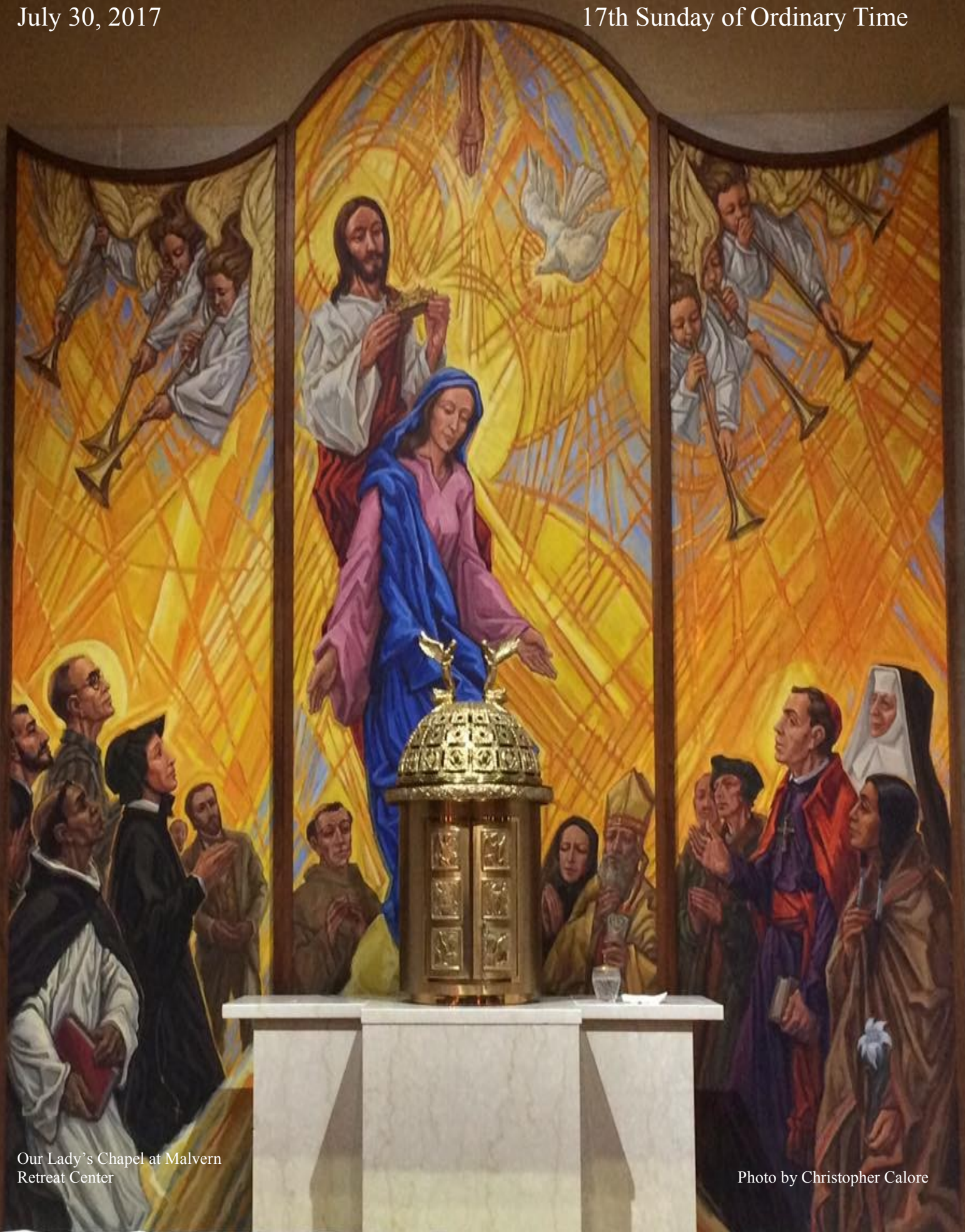
Our Lady's Chapel at Malvern Retreat Center