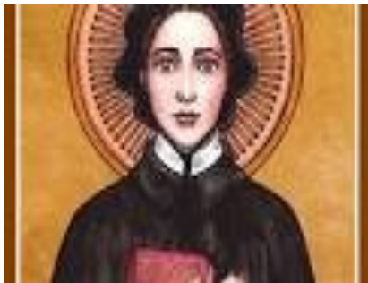
Saint Elizabeth Ann Seton Feast Day, January 4th

New to the area? Just visiting? You will find a warm welcome here! To become a registered member, please call the parish office during regular business hours.