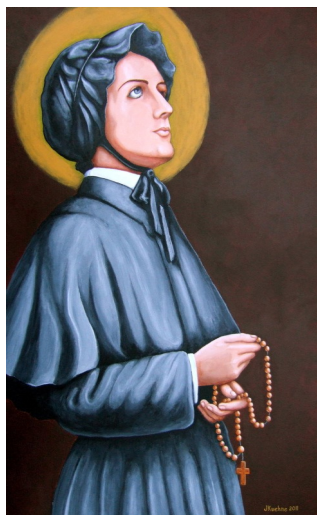
St. Elizabeth Ann Seton, pray for us!

Bulletin deadline: Friday, one week prior to the publication week.