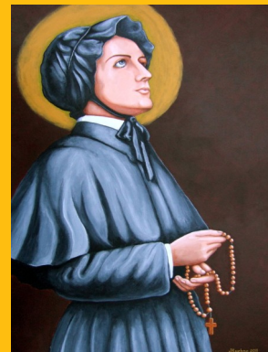
St. Elizabeth Ann Seton Pray for Us!

Bulletin deadline: Friday, one week prior to the publication week.